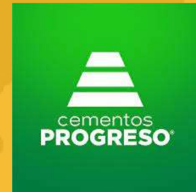
Cementos Progreso Guatemala