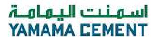
Yamama Cement - Saudi Arabia