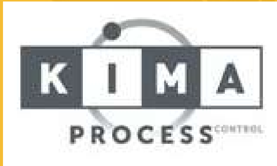
KIMA Process - Germany

KIMA Process Control provides experience in advanced measurement and control in cement grinding and pyro processes, developing new sensor technologies and advanced control systems for almost 25 years. Its focus is the development, production, and commercialization of industrial measurement and control technologies.