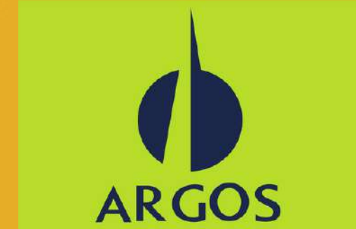
Cemento Argos Colombia