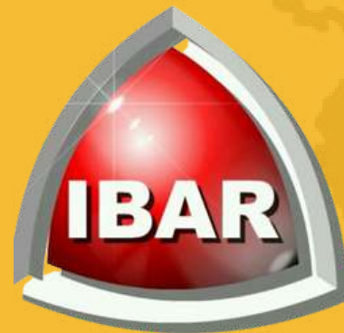
IBAR Refractories Brazil