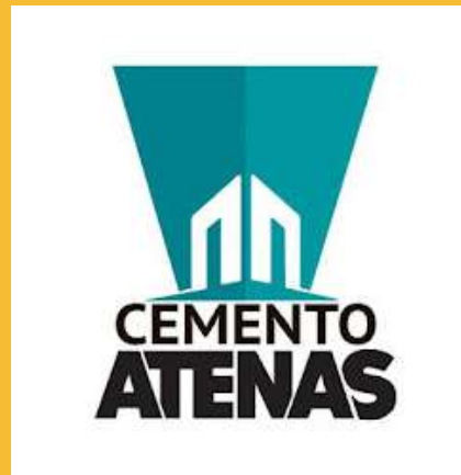
Cemento Atenas Ecuador