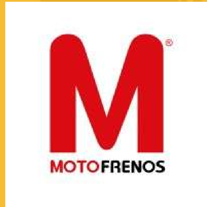
MotoFrenos - Colombia

MotoFrenos SAS is a metalworking company founded in 1978. We specialize in designing, manufacturing and assembling equipment and parts for the industrial sector in general. Our production department counts on a flexible line of manufacturing and we provide services to multiple sectors of the Colombian industry. Also, our products and services are exported to 21 countries in Europe, South, Central and North America.