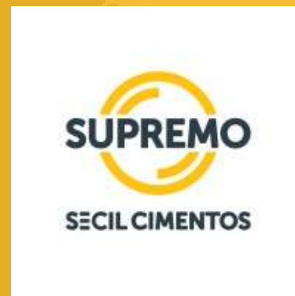
Supremo Secil Brazil